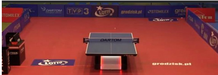
example - show court with BBGs zones

The clubs are recommended to make a training session with the BBGs.