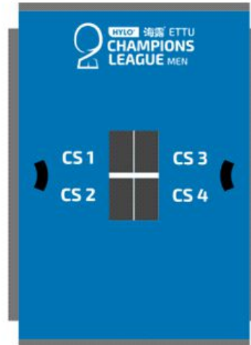
Fig. 2 – Floor stickers layout

Long-side of the table: HYLO ETTU Champions League Men