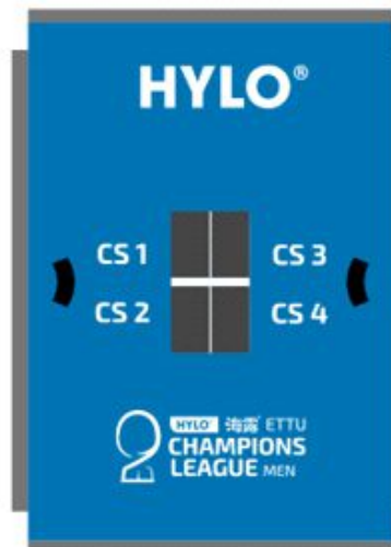
Fig. 3 – Floor stickers layout if HYLO floor sticker is confirmed by ETTU

Long-side 1 of the table: HYLO ® Long-side 2 of the table: HYLO ETTU Champions League Men