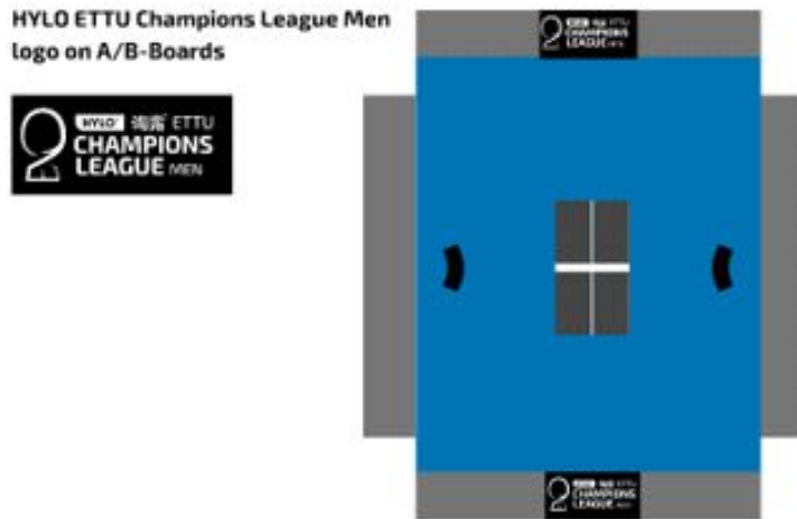
Fig. 4 - HYLO ETTU Champions League logo placement on A/B-Boards

At least one surround board displaying the HYLO ETTU Champions League Men logo must be positioned at the centre of each long side of the FoP, on the side facing the camera, as illustrated below: