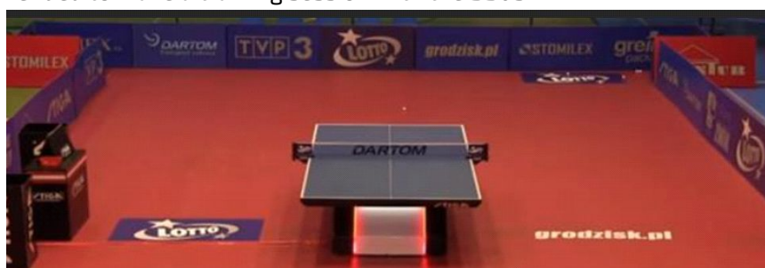
example - show court with BBGs zones

The clubs are recommended to make a training session with the BBGs.